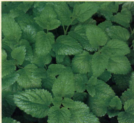
HERB, MOUNTAIN MINT Pycnanthemum virginianum