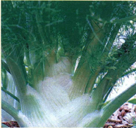
HERB, ENGLISH LAVENDER Lavandula angustifolia