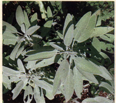
HERB, SPEARMINT Mentha spicata