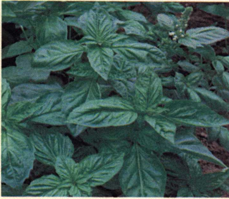
HERB, CATNIP Nepeta cataria