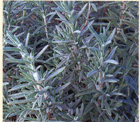
HERB, AZURE BLUE SAGE Salvia azurica