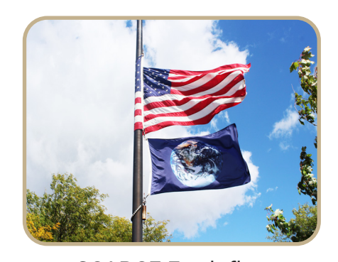
SCARCE Earth flag