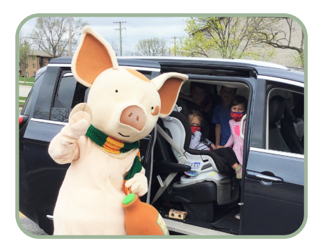
Pig's Visit to the LLD