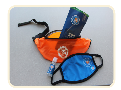
DuPage County Masks and Sanitizer Giveaway